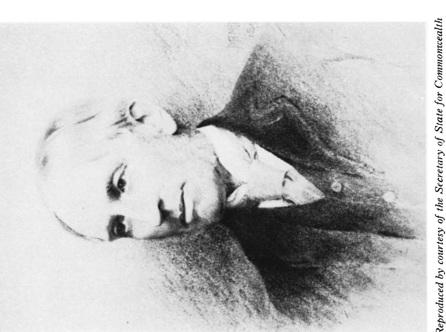
Reproduced by courtesy of the Secretary of State for Commonwealth Affairs Sir Louis Mallet, Permanent Under Secretary of State for India, 1874–83